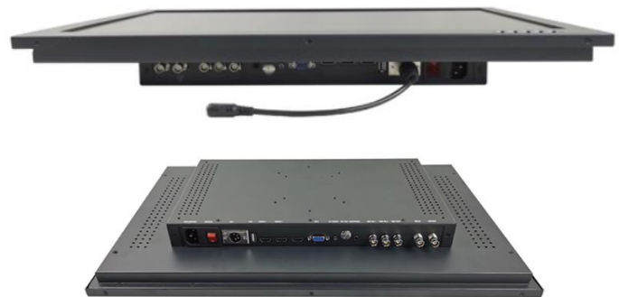
24" Flipping Fusion (16x9) metal chassis